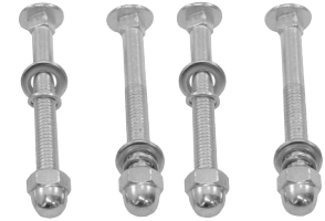
Mounting Hardware Kit