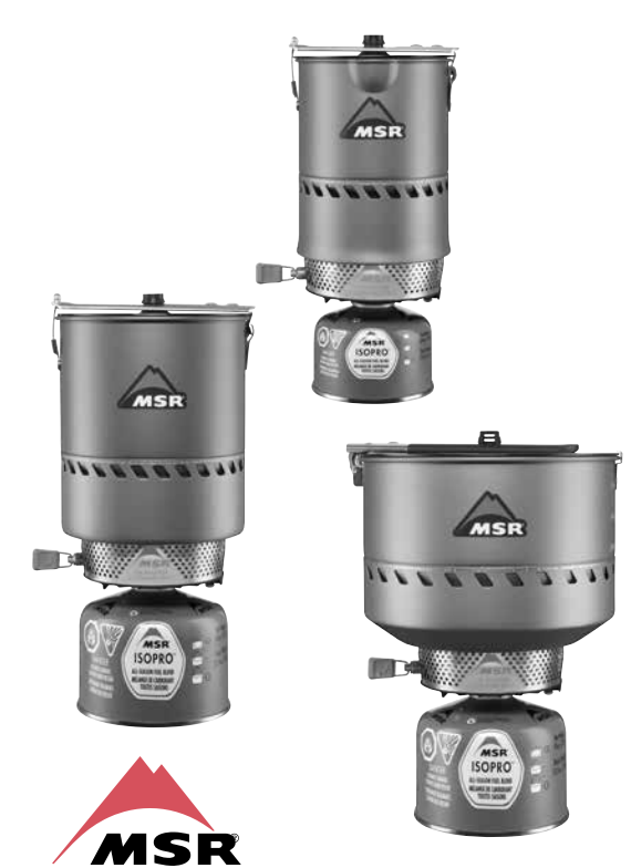
MOUNTAIN SAFETY RESEARCH®